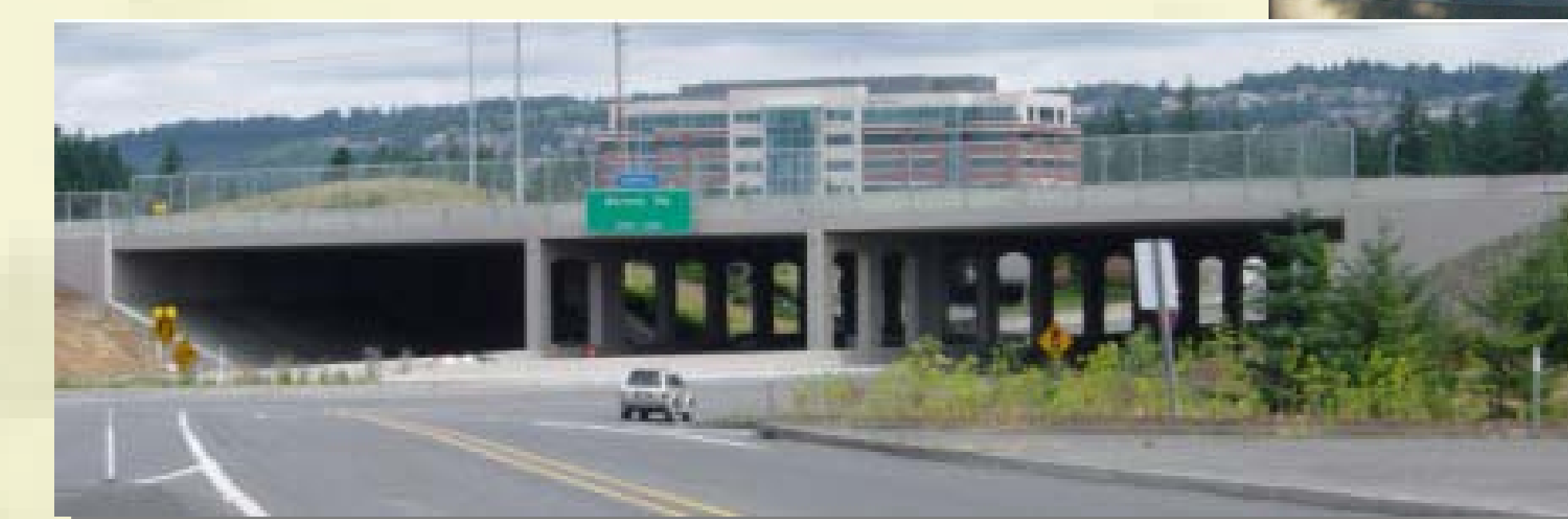
Precast Slab Bridge on Hwy. 26

MASEEH COLLEGE OF ENGINEERING AND COMPUTER SCIENCE