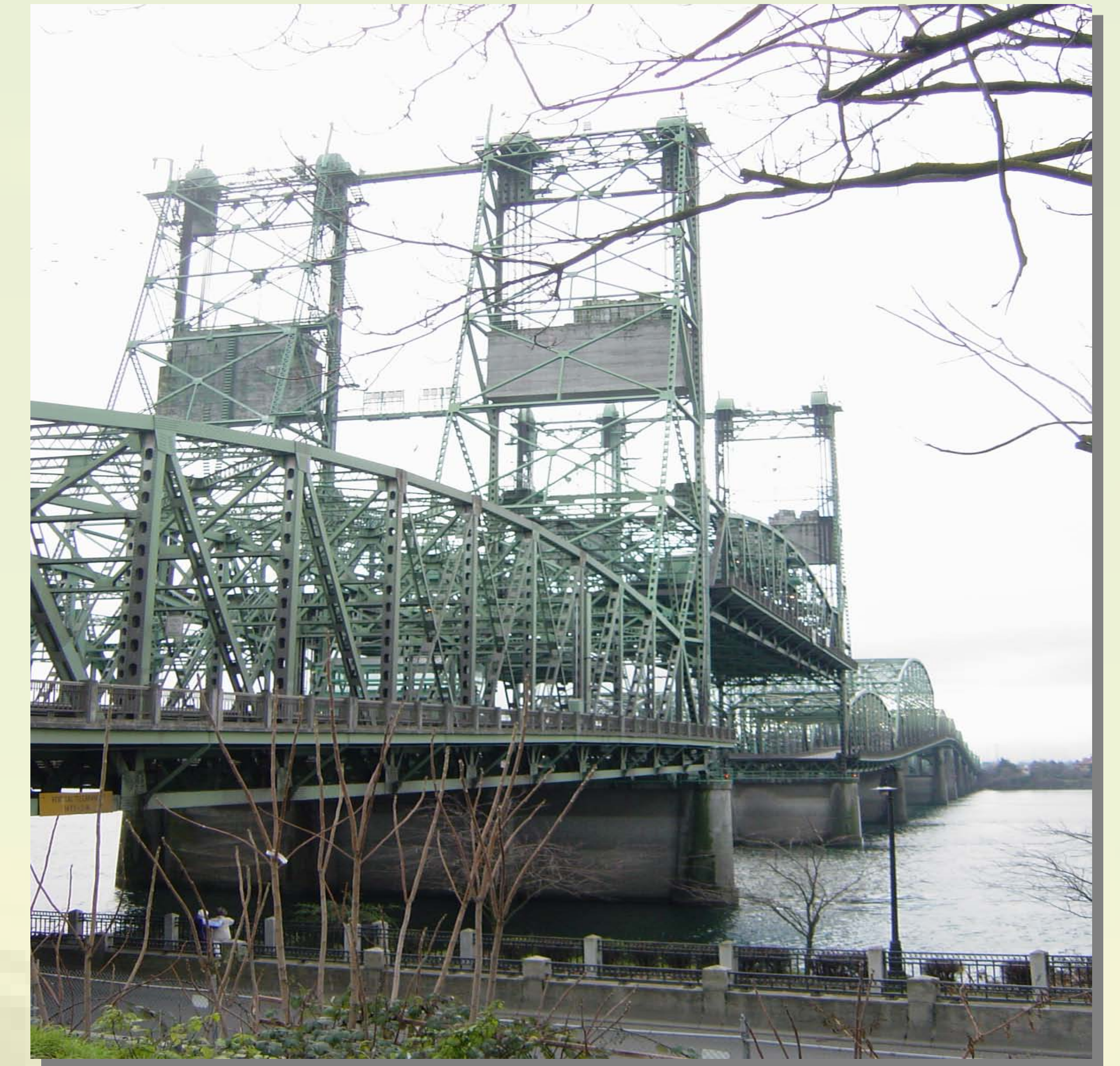
I-5 Columbia River Crossing