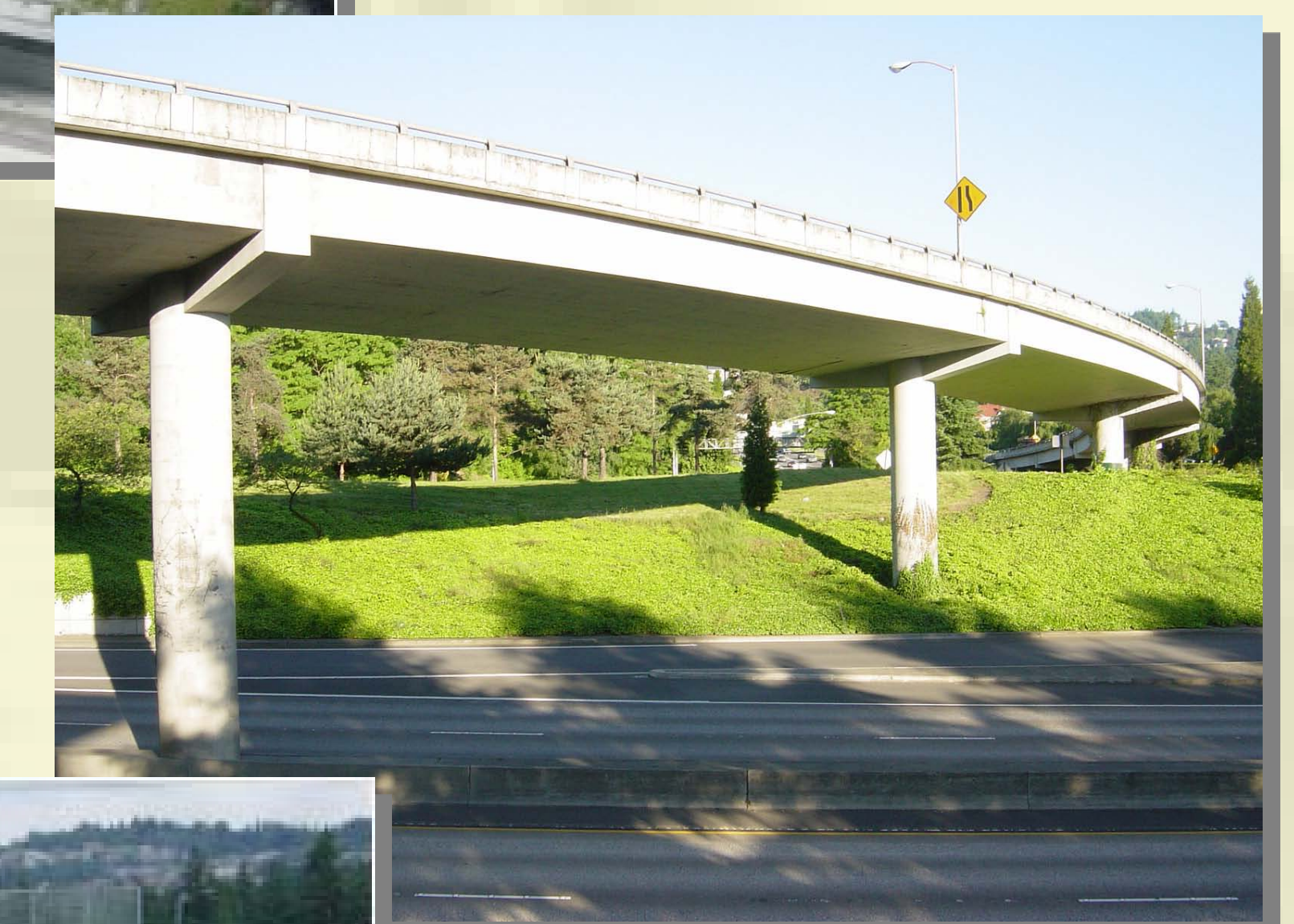
Curved Concrete Box Approach onto Hwy. 26